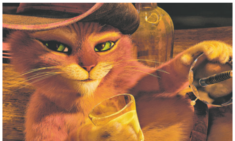
"Puss in Boots," with a main character voiced by Antonio Banderas, is in theaters now.

AMC LOEWS FREEHOLD METROPLEX 14 , 101 Trotters Way, 888-AMC-4FUN — 50/50 (R) 7:10. Anonymous (PG-13)